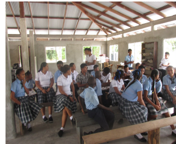
The devotion hall where all major gathering happens

During these months self esteem was built, young people were converted, and a stronger relationship was built between the staff and the students. The team threw themselves into the work and the village witnessed the steadfastness of the workers of Christ through the adversities of life.