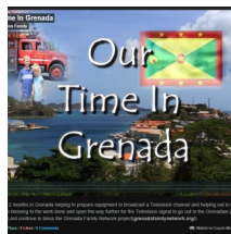
Summary of New Online Resources.