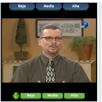
Spanish and French Channels Streaming!