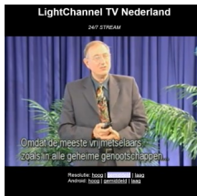
Light Channel Netherlands Streaming!