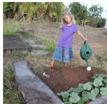
Challenges in Grenada.