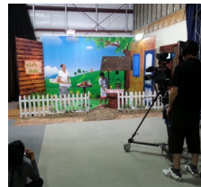
New Studio Equipment for Bolivia.